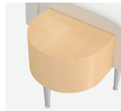
HALF ROUND END TABLE The Zola Half Round End Table is non-handed and can be easily field installed and reconfigured.

A large selection of both linked and freestanding tables complete the extensive Zola offering. Tables are available in Cherry, Maple and Beech veneers, plastic laminate, and Palette finishes - and an optional non-porous and scratch-resistant solid surface top.