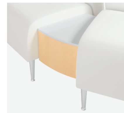
CORNER TABLES A variety of curvilinear corner tables gives Zola the ability to accommodate any space with virtually an endless amount of configurations.