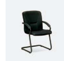
1090-AMB guest chair