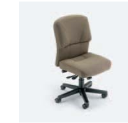
92-MB mid back, no arms

Rhythm is designed for long-term sitting comfort in addition to allowing for more immediate responsiveness. The Rhythm series offers mid and high back task chairs with the choice of three arm designs and an optional adjustable back height.