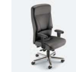
93-HB high back, pad arms