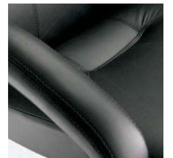
Leather wrapped cantilever