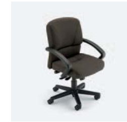
90-MB mid back, cantilever urethane arms