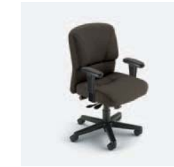
93-MB mid back, pad arms