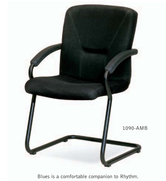
Blues is a comfortable companion to Rhythm.