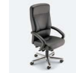
99-HB high back, cantilever upholstered arms