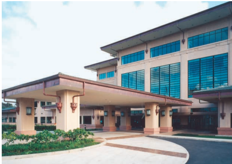
NIMITZ-MacARTHUR PACIFIC COMMAND CENTER