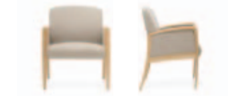
JOR2-G24CLS COM YD. SEAT & BACK – 1.9 COM YD. SEAT – 0.9 COM YD. BACK – 1.4 COM YD. CLOSED ARM PANEL – 0.9