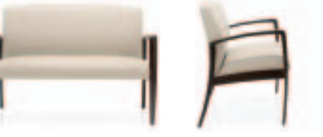
JOR2-G440PS COM YD. SEAT & BACK – 2.7 COM YD. SEAT – 1.1 COM YD. BACK – 1.6 COM YD. CLOSED ARM PANEL – 0.9