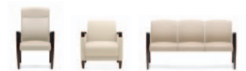
Jordan is an extensive collection, shown in four product brochures: Guest and Bariatric Seating, Patient Seating, Lounge Seating, and Multiple Seating and Tables.