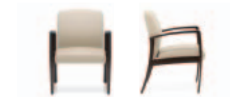
JOR2-G210PS COM YD. SEAT & BACK – 1.6 COM YD. SEAT – 0.9 COM YD. BACK – 1.4 COM YD. CLOSED ARM PANEL – 0.9