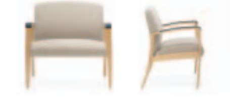
JOR2-G300PU COM YD. SEAT & BACK – 2.7 COM YD. SEAT – 1.1 COM YD. BACK – 1.6 COM YD. CLOSED ARM PANEL – 0.9