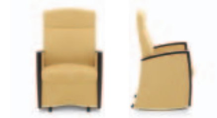
JOR6-GL24WOD COM YD. SEAT & BACK – 2.2 COM YD. SEAT – 0.9 COM YD. BACK – 1.9