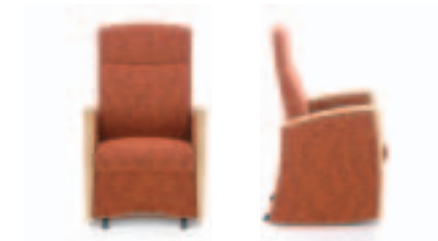
JOR6-GL21WOD COM YD. SEAT & BACK – 2.2 COM YD. SEAT – 0.9 COM YD. BACK – 1.9