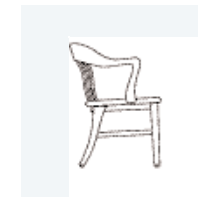
177-A Wood Seat