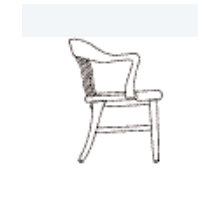
179-A Upholstered Seat