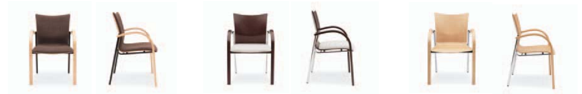
BAL2A2B Upholstered Front